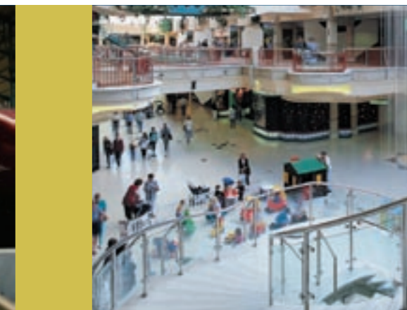
Monitor shoppers in a mal