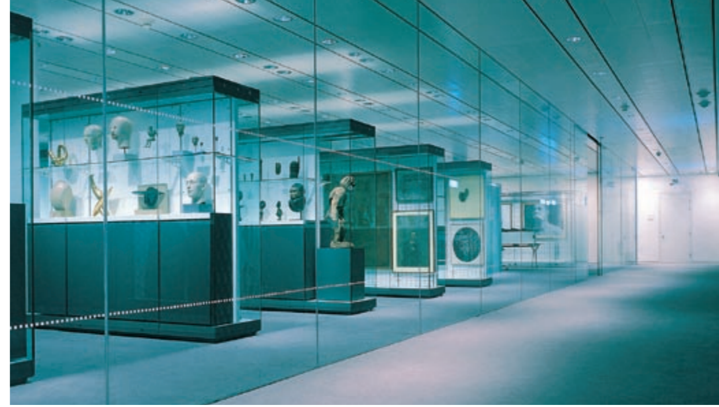
Guard valuable collections in libraries and museums