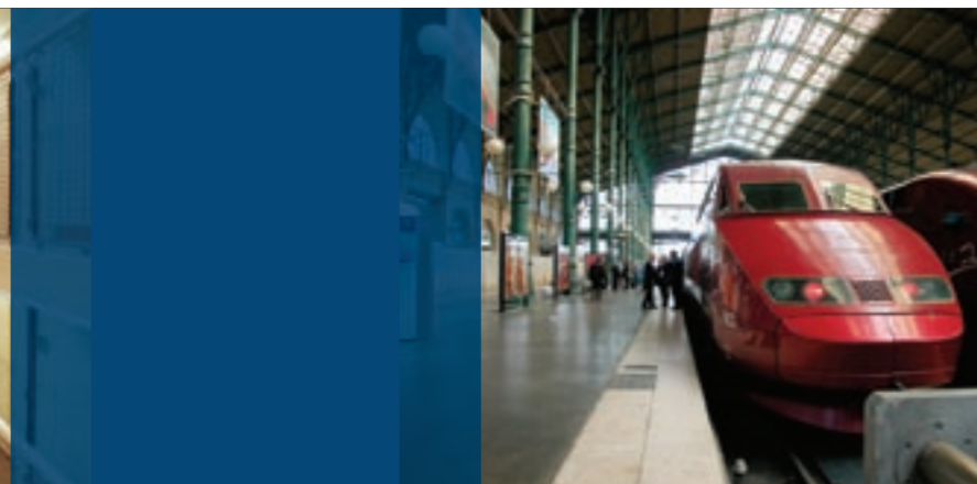
Identify passengers in the station