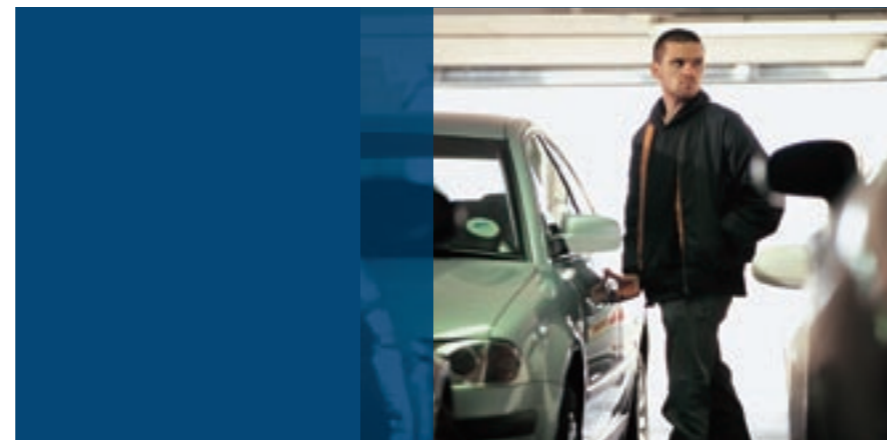
Keep a watchful eye on parking lot and garages

FlexiDome XT offers all the benefits of an impact-resistant dome camera with varifocal lens that meets the highest professional standards, but at a much lower cost than conventional reinforced cameras. This makes it an economic, no-compromise choice for use in higher-risk areas, avoiding possible loss of surveillance coverage and the costs of replacing damaged cameras.