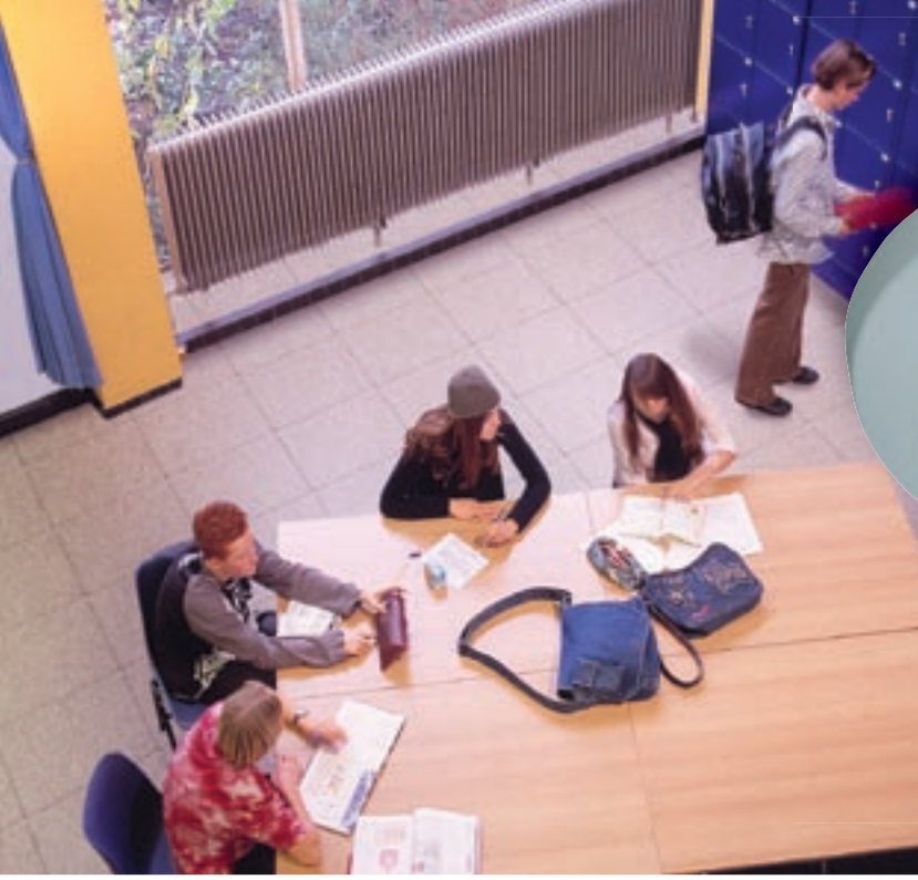
Supervise students and property in schools